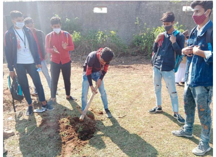
Plantation at Chundawat Khedi Village